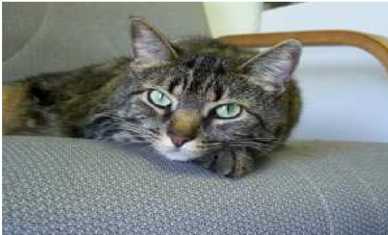
Pet of the Week ~Hazel of EMC2~