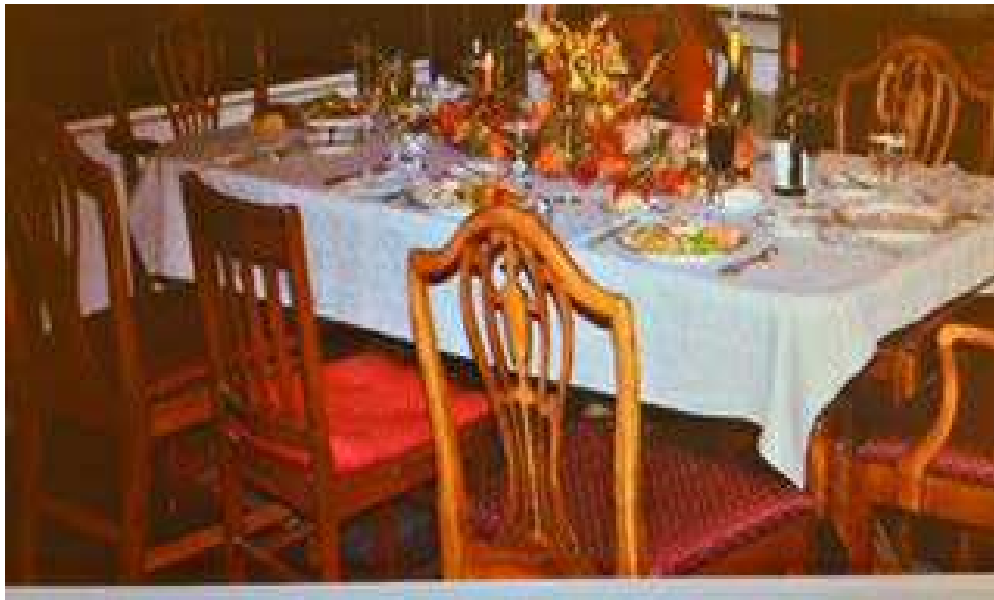
From our table to yours, Happy Thanksgiving from all of us at EMC2.