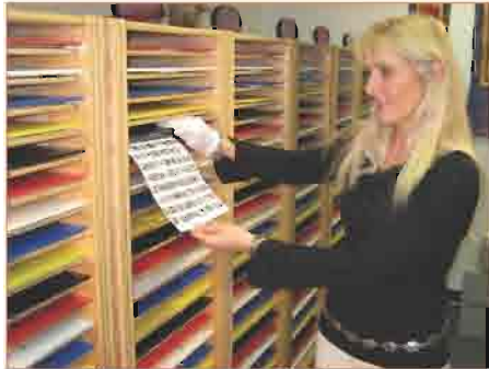
Photographs are digitized and used to receive the balancing energies.

Step 4 You immediately begin receiving balancing frequencies, which allow you to heal yourself. Your Facilitator is always available to answer any questions or concerns, and to offer you guidance in your self-healing process.